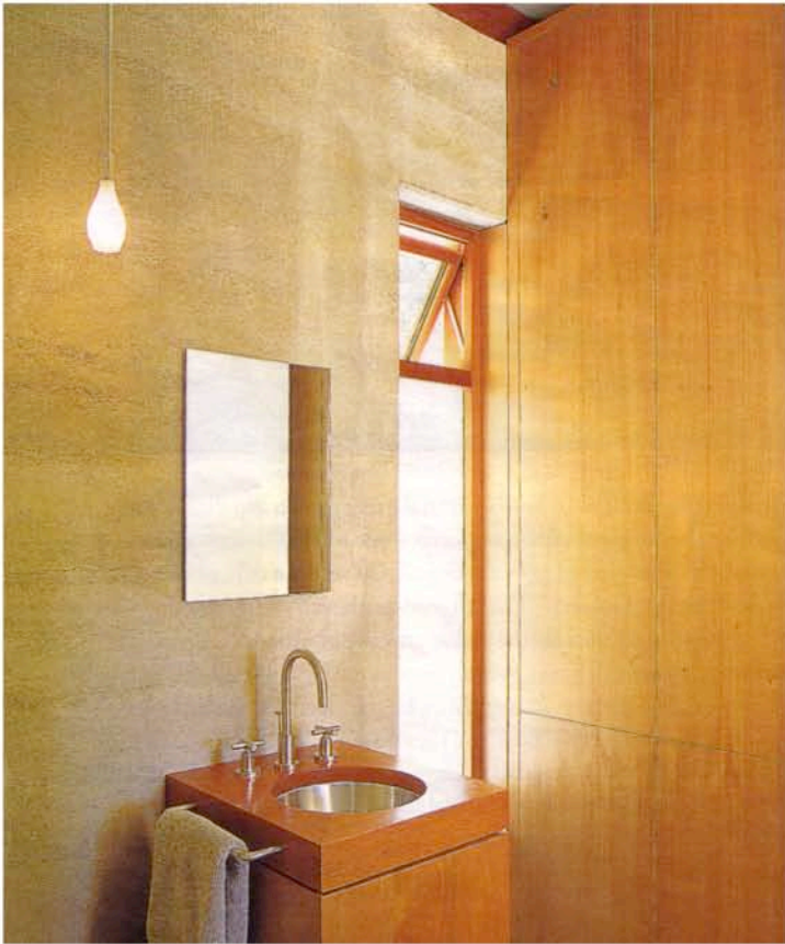
Top: Vineyard view from the master bedroom. Above: Bathrooms and the laundry are arranged along the south-facing rammed-earth wall with small window openings. Right: A central skylit spine connects the kitchen (foreground), an enfilade of living-dining spaces and the master bedroom. Floor-to-ceiling bookshelves and anigré cabinets double as room dividers.